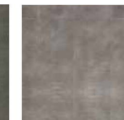
S5: Crystal Grey