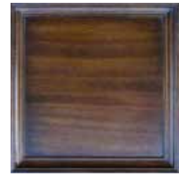
G1: Cotswold (H) A deep clear brown finish with a medium-high sheen level is apt for a formal traditional or urban high-end contemporary look.