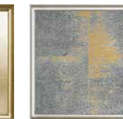
SG: Silver Leaf with Gold Created by applying gold painted ground color, hand-applying silver leaf sheets in a grid pattern, then wearing the edges.