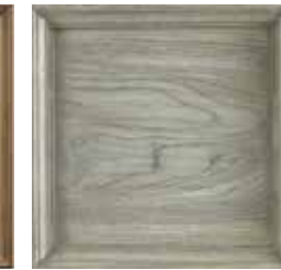
N6: Earth Grey (L) The earth grey finish offers casual light grey hues with a dry antique vintage character.