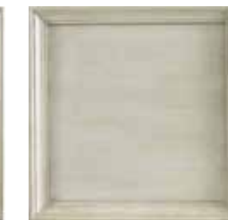
H2: Sancere (L) A warm, creamy ivory painted finish with a very light brush-stroke glaze applied over the top.