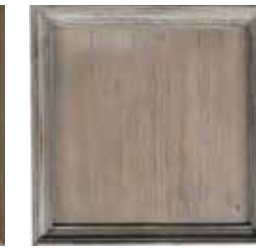
J5: Slate (L) A multi-step finish starting with a medium brown finish, then overlaid with a grey-beige secondary finish.