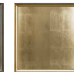
GS: Gold Leaf Squares Painstakingly applied by hand in a grid pattern with very subtle black highlighting.