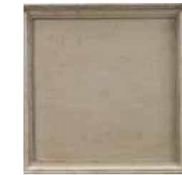
17: Dove (L) A soft patinated Belgian grey finish, burnished and detailed with a gently spattered antique glaze.