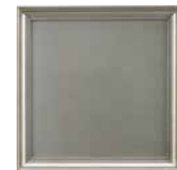
87: Platinum (M) Platinum is a metallic finish with an underlying base of silver and subtle hand-padded gold overtones, giving a platinum patina.