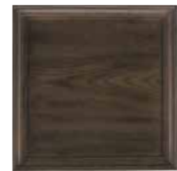
A2: Modern Elm A2 (M) Developed to take advantage of elm veneer grain patterns, this warm greyish-brown high sheen creates a soft, transitional look.