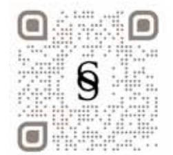
View finishes online

Our designers have developed over 40 finish options that allow you to customize any selected item. Whether you choose a bright metallic finish like Platinum or a warm brown like Cashmere, we offer a variety of finishes to help you be creative and personalize each piece to your desired style.