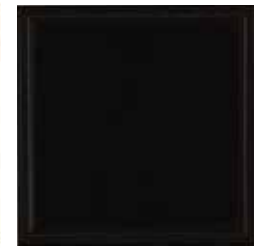
K2: Black (L) A rich and true black finish with a deep luster.