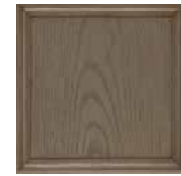
M5: Silver Fox (H) Metallic silver color that is very refined, allowing for translucence to showcase the natural beauty of the wood.