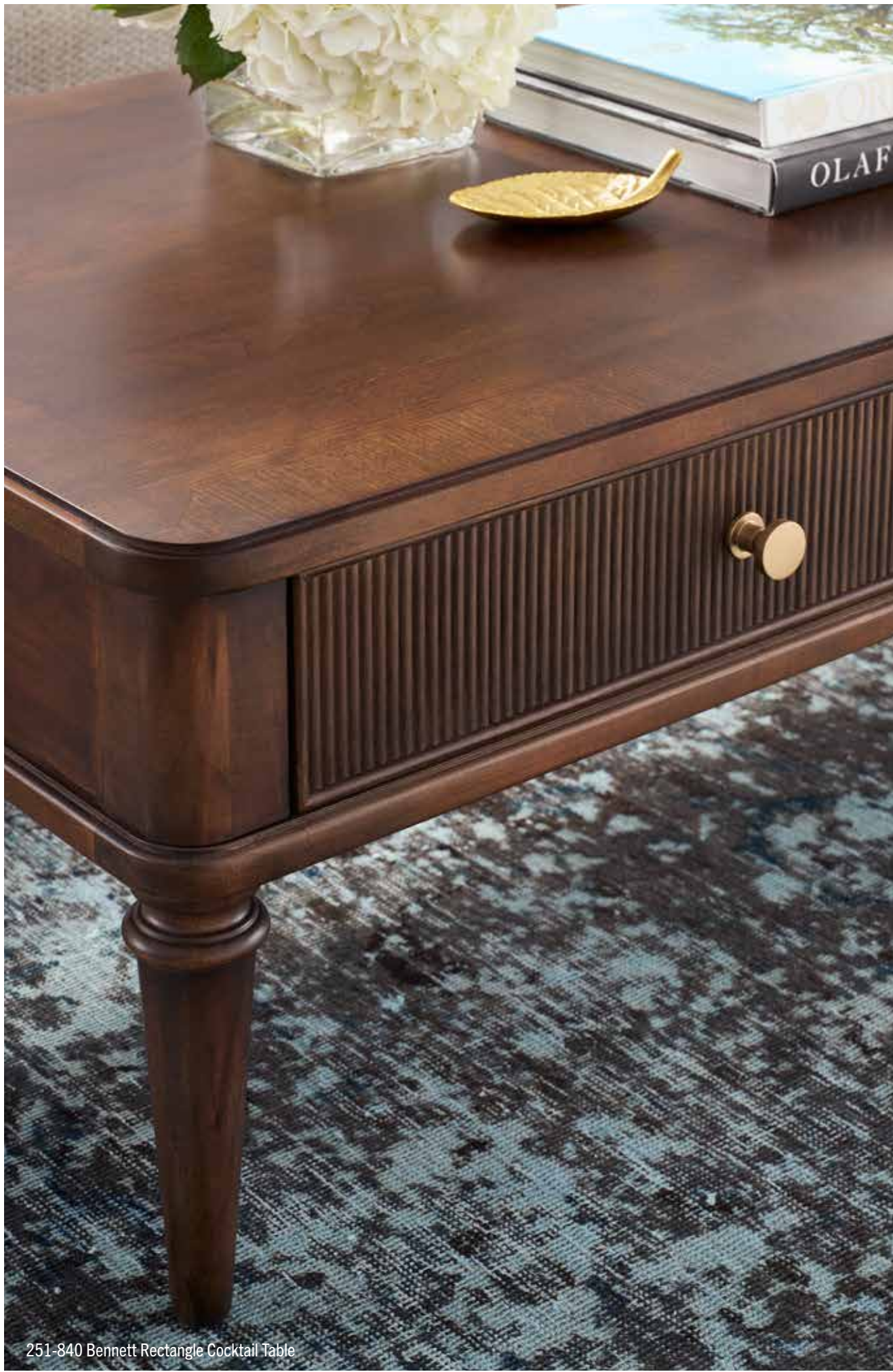
251-840 Bennett Rectangle Cocktail Table