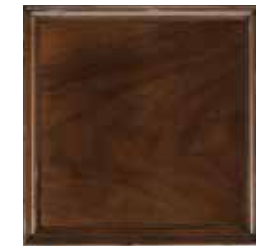
55: Soho (H) A rich, medium-value, clear brown finish reminiscent of a lightly burnished antique pecan with a high sheen level.