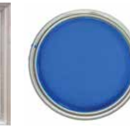
CM: Color Match (M) Select any brand name paint color, and we will Color Match it on your order; include name, number, and color chip with the order.