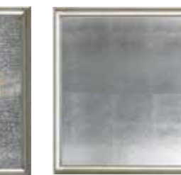
SS: Silver Leaf Squares Painstakingly applied by hand in a grid pattern with very subtle black highlighting.