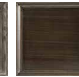
P3: Smoked Walnut (L) Natural clarity of the wood is enhanced with a darkened stain.