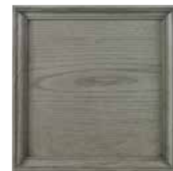
J7: Mineral (L) Grey-stained finish with some translucence which accentuates the wood character of the item.