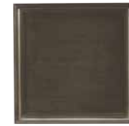
39: Black Nickel (H) A deep nickel-colored paint finish with very fine black brushing on top and a high sheen to resemble black nickel metal.