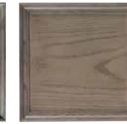
35: Smoked Ash (H) Semi-opaque greige finish.