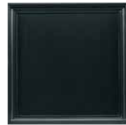
21: Espresso (M) Deep rich black traditional finish with a deep luster that has a very light rub-through along the perimeter edge.