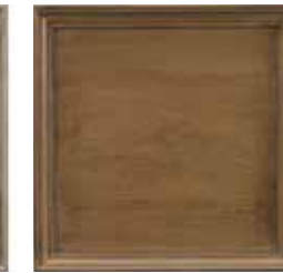
76: Driftwood (L) A neutrally aged pecan-toned finish enhanced with a bleached grey-beige overtone to characterize a weathered antique.