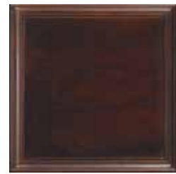
C7: Cashmere (H) The warmth and elegance of this high-sheen dark walnut finish adds a touch of class and refinement to any item.