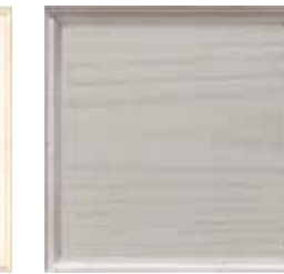
Q6: Wishbone (L) Subtle cerusing in this off-white palette creates a casual, inviting feel.