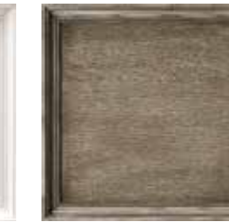
N4: Vintage Grey (M)** Casual semi-opaque grey finish with grain character highlighted through sandblasting. **AVAILABLE ON ASH & OAK SANDBLASTED ITEMS ONLY.