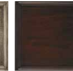
30: Walnut (H) A sophisticated high sheen finished walnut brown with russet undertones enhancing the natural beauty of wood.