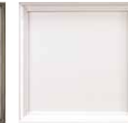
28: Sugar (L) An opaque, clean white finish with a very slight intermittent rub-through along the perimeter edge.