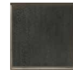
BZ: Bronze Patina Bronze Patina is an organic, variegated finish comprised of browns and greys reflecting an acid-washed surface.