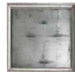
ML: Black Pearl Silver leaf squares that are heavily worn-through, over top of a high gloss black paint background.