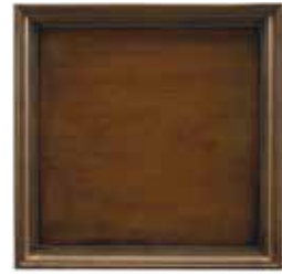
10: Beeswax (H) A medium brown high sheen finish with hand-applied burnishing and a deep luster.