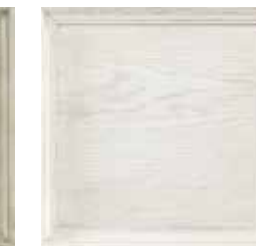
P6: Sandstone P6 (L) Sandstone is a casual lighter hue with a whitewashed canvas effect. The depth of the finish is subtle and crafted with character.