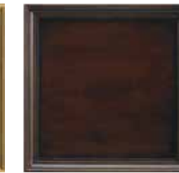
07: Maison (H) A rich hand-rubbed waxed dark walnut high sheen finish enhanced with hand-burnished edges, cow tailing, and a light antique spatter.