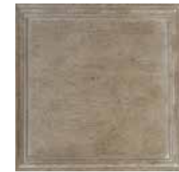
J3: Washed Canvas (L)* Has a white filler intended to hang up in the grain, then sealed, dry-brushed, visually distressed, and finished with three coats of lacquer. *AVAILABLE ON ASH & OAK ITEMS ONLY.