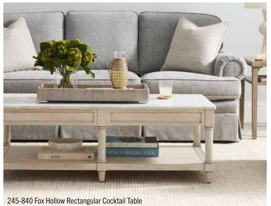
245-840 Fox Hollow Rectangular Cocktail Table