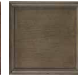
79: Stone (L) Very clean grey-beige finish that reads through to the beauty of the wood grain beneath.