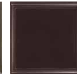
C8: Café Noir (H) The color of rich, dark Colombian coffee; a beautifully sleek, dark brown/black finish with a high sheen.