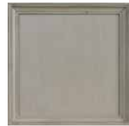
B2: Fog Grey (L) An opaque grey paint with a light taupe surface spatter providing a more casual and slightly aged appearance.