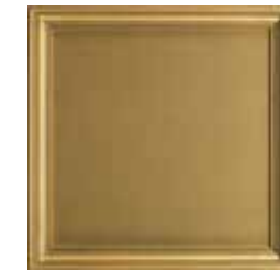
F4: Gold (L) Gold paint with a glazed appearance to emulate the beauty and appearance of gold leafing.