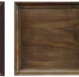
M2: Carob Brown (L) A low sheen and warm brown finish enhances Walnut's beautiful grain and warm tonal ranges.