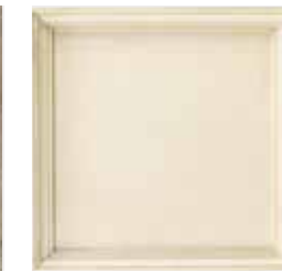
34: Washed Linen (L) Clean, off-white finish with a very light rub through, providing the natural look of washed cotton or flax.