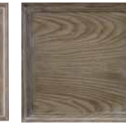
A5: Smoke Ash Sandblasted (L)** Semi-opaque greige finish with sand blasting technique to create wood character.**AVAILABLE ON ASH & OAK SANDBLASTED ITEMS ONLY.