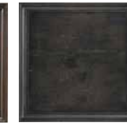
C3: Malabar (M) A wonderfully soft black finish with brown undertones.